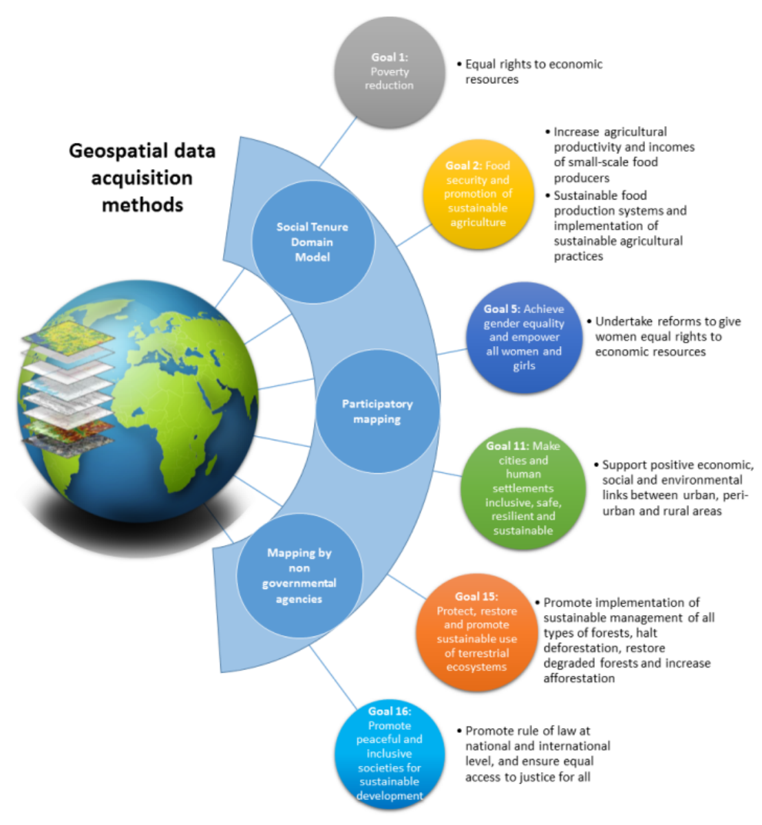
Figure 3: Application of geospatial and spatial data acquisition methods to the Sustainable Development Goals

Figure 3 above explains geospatial and spatial data acquisition methods which will be needed for reporting by countries on the SDGs and which will help Member States to achieve the goals and targets set by the Post 2015 Sustainable Development Goals. The data acquisition methods will be linked to the dare/land registration, the land administration domain model, the social tenure domain model, mapping by national agencies and non-governmental bodies including participatory mapping. Both conventional and fit-for purpose land administration will be needed to supply the data for these reports based on the indicators that will be prescribed.